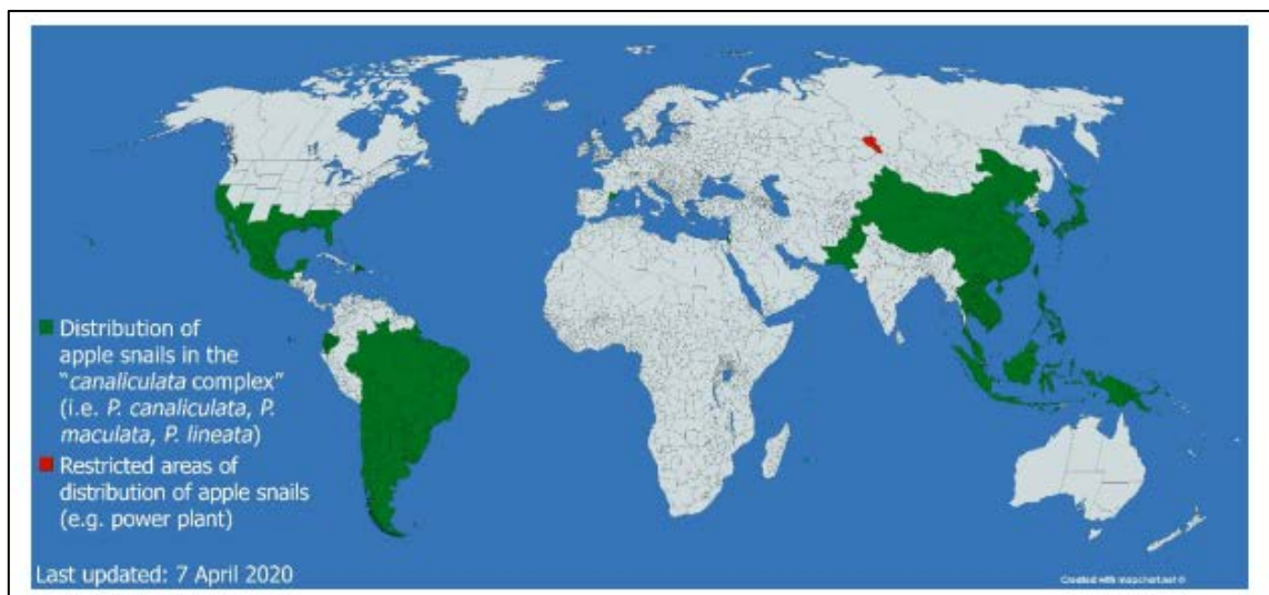
Fig. 3. Global distribution of apple snails in the ' canaliculata complex'. Reproduced from EFSA et al. (2020).

were eradicated from this area, they subsequently spread to a new region in northern Spain (Joshi, 2016; Joshi and Parera, 2017) but were eradicated there too in 2020 (EFSA et al. , 2020). Small populations of Pomacea spp. were also successfully eradicated from municipalities in Switzerland and France (EFSA et al. , 2020). Unconfirmed reports of P. lineata (possibly misidentified and actually P. canaliculata ) occur from South Africa (Berthold, 1991) and Shivambu et al. (2020) reported P. canaliculata from the South African pet trade. Pomacea canaliculata has also been detected in La Réunion and Mauritius (EFSA et al. , 2020; EPCO, 2020). Pomacea spp. invasions have also occurred in Dominican Republic (Rosario and Moquete, 2006), and in Haiti (R.C. Joshi, unpublished USAID consultancy report, 9–24 December 2018). The global distribution of the apple snail is shown in Fig.3.