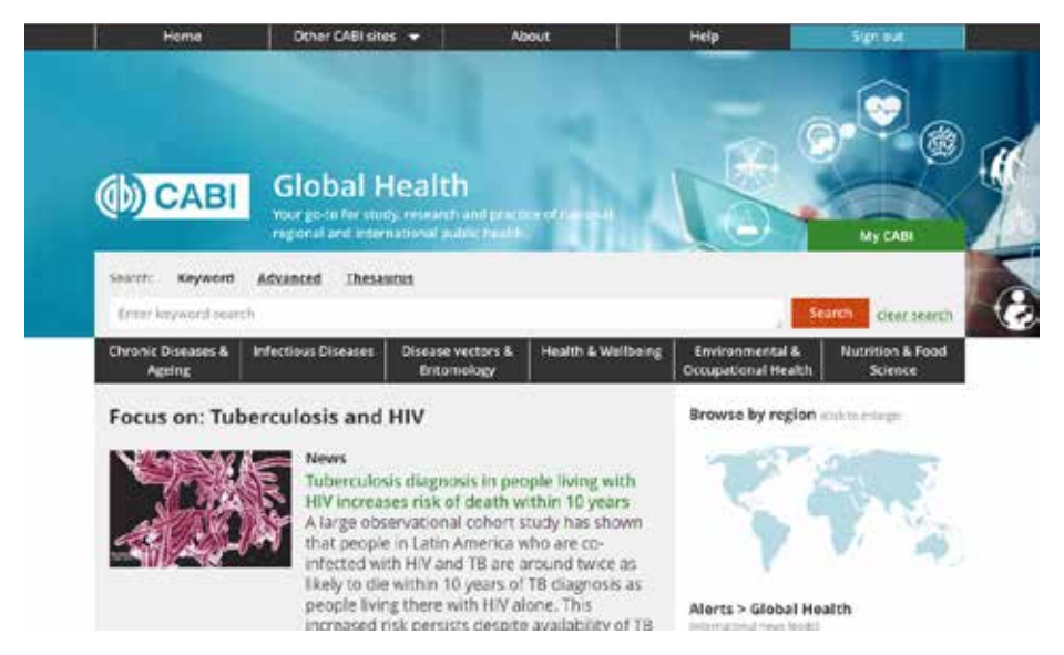
Figure 1 Our new Global Health interface