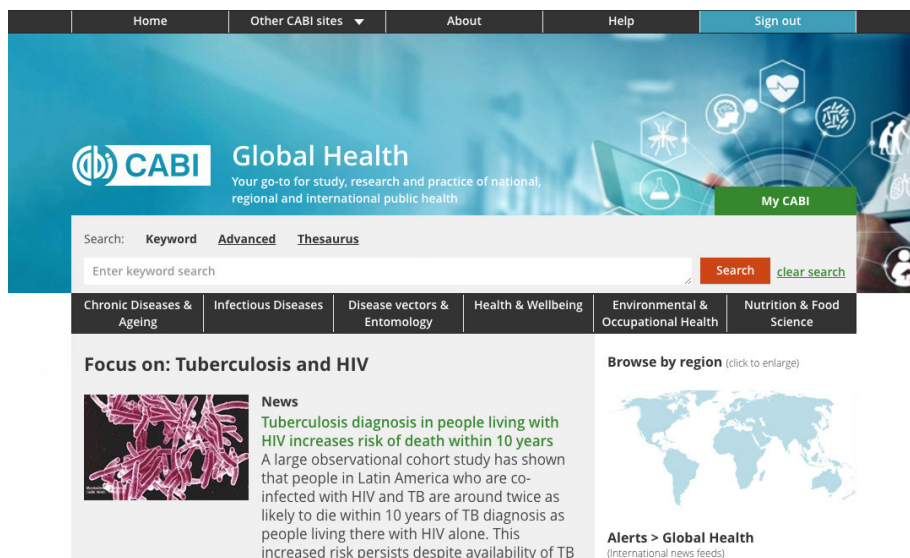
Figure 1 Global Health interface