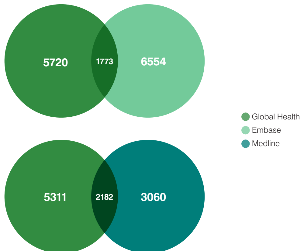
Figure 2 Global Health Comparison with Medline and Embase. Figures correct as of March 2020