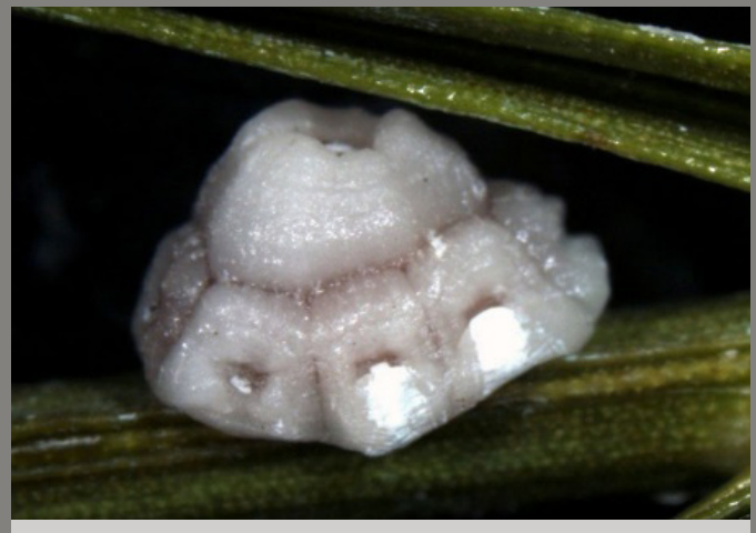
Ceroplastes rusci.

14. Soft wax scales, ceroplastes species