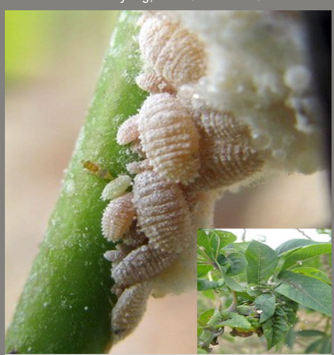
Photo: A. Winatoi, Dept. of Agriculture, Thailand; Inset photo: "bunchy top"- Pestnet.org

15. Cassava mealybug, Phenacoccus manihoti