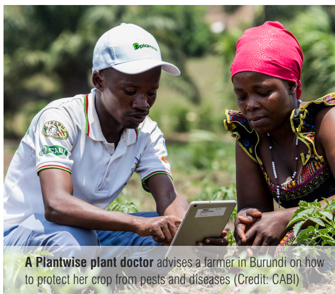
A Plantwise plant doctor advises a farmer in Burundi on how to protect her crop from pests and diseases

A CABI-led study has proposed seven key steps which should be taken to strengthen Burundi's plant health system (PHS) and in doing so help improve the country's food security and ability to tap into valuable export markets.