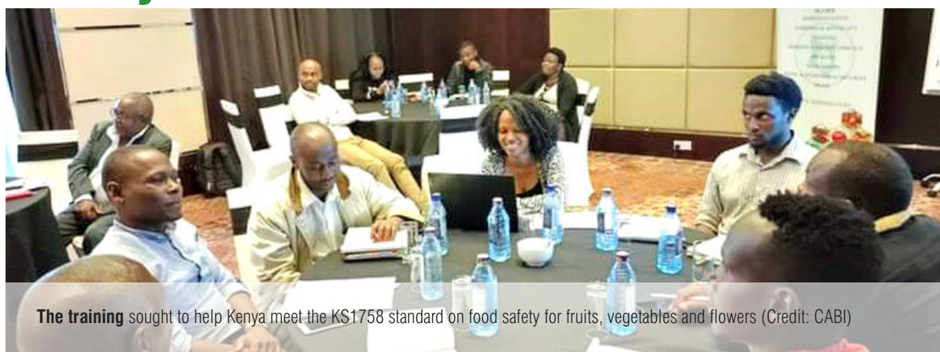
The training sought to help Kenya meet the KS1758 standard on food safety for fruits, vegetables and flowers

CABI – through the PlantwisePlus programme and in partnership with the Fresh Produce Consortium of Kenya (FPC Kenya) – has delivered training to help Kenya meet the KS1758 food safety standard for its fruits, vegetables and flowers.