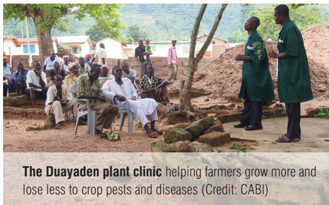
The Duayaden plant clinic helping farmers grow more and lose less to crop pests and diseases

A new CABI-led worldwide programme – PlantwisePlus – launches in Ghana to help smallholder farmers produce more high-quality food.