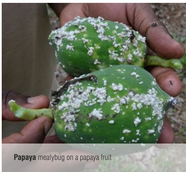
Papaya mealybug on a papaya fruit

Papaya mealybug, Paraccous marginatus , is native to Central America but has spread rapidly in invaded countries. It was detected in Uganda in 2021 where it has the potential to affect the production and quality of papaya and other host crops.