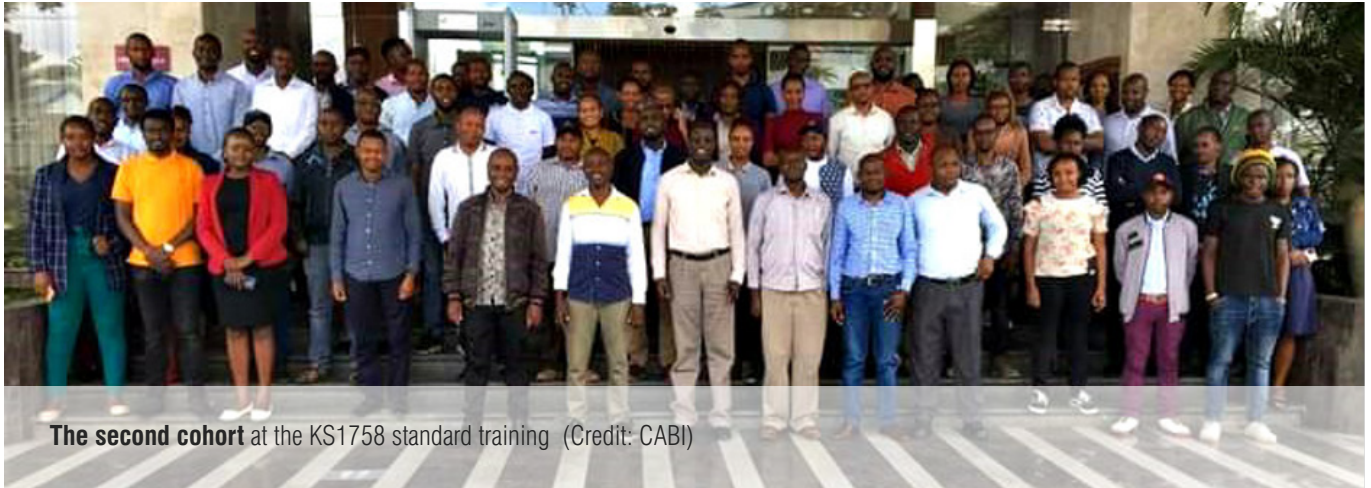
The second cohort at the KS1758 standard training

The six-day training was provided for 120 trainers, who represent different fruit, vegetable and flower exporters in Kenya, on issues such as post-harvest handling, labour safety, pesticide use, plant nutrition, traceability and record keeping.