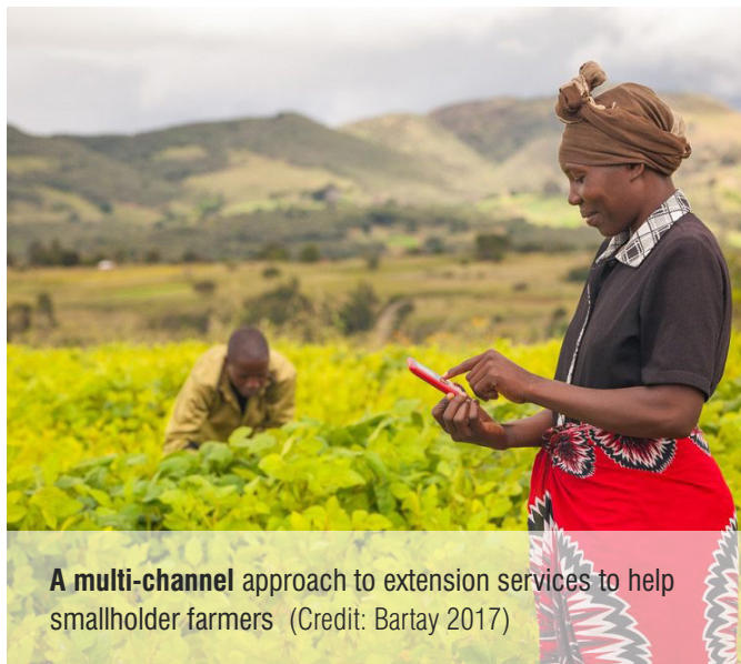
A multi-channel approach to extension services to help smallholder farmers

extension methods, such as plant health rallies.