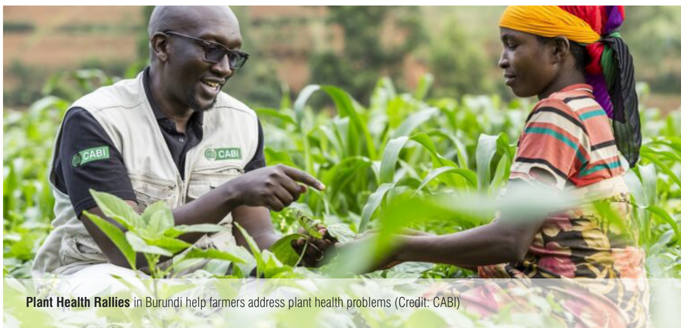
Plant Health Rallies in Burundi help farmers address plant health problems

Plant health in Burundi is getting a boost from plant health rallies. These events are a novel way of reaching farmers with plant health knowledge to help them take