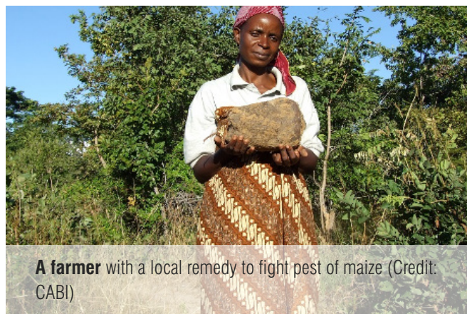
A farmer with a local remedy to fight pest of maize

A new publication led by CABI has highlighted institutional and policy bottlenecks to using Integrated Pest Management (IPM) to fight a range of potentially devastating crop pests in Africa.