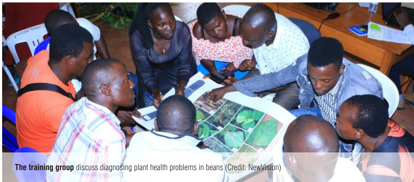
The training group discuss diagnosing plant health problems in beans

The CABI-ZAABTA youth agricultural training programme is changing the story for young people in Uganda. We look at the initiative and why it is showing signs of success.