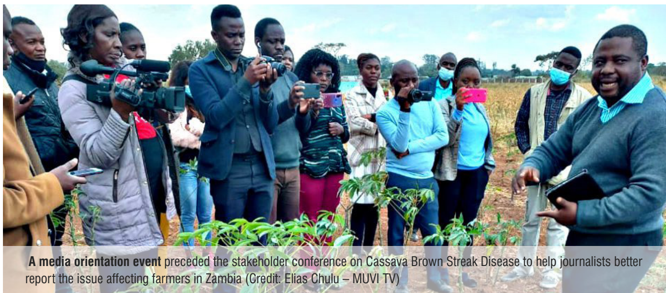
A media orientation event preceded the stakeholder conference on Cassava Brown Streak Disease to help journalists better report the issue affecting farmers in Zambia