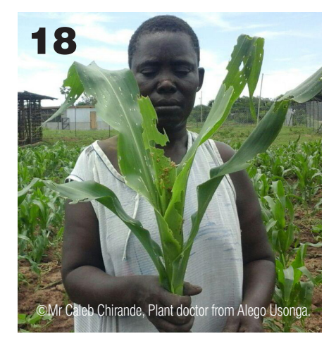
Holding a maize plant damaged by Fall Armyworm.

This publication was made possible through support provided by the Office of U.S. Foreign Disaster Assistance, Bureau for Democracy, Conflict and Humanitarian Assistance, U.S. Agency for International Development, under the terms of Award No. AID-OFDAI0-17-00093. The opinions expressed in this publication are those of the authors and do not necessarily reflect the views of the U.S. Agency for International Development.