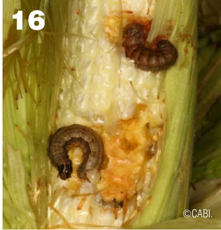
Fall Armyworm infestation causes stunting and destruction of developing tassels and kernels, which reduces grain quality and yield.