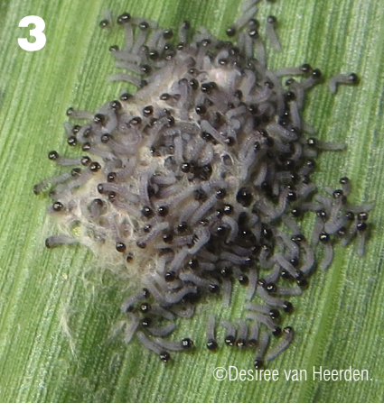
After hatching, the young caterpillars begin feeding on the leaves.

Eggs are covered in protective scales rubbed off from the moths abdomen.