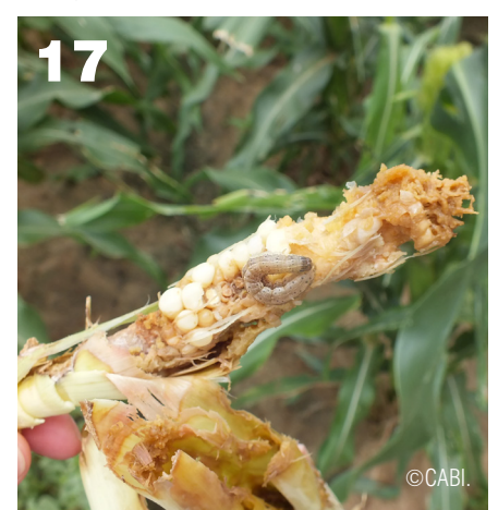
When the caterpillars burrow into the side of the cob, damage to grains can lead to rot.