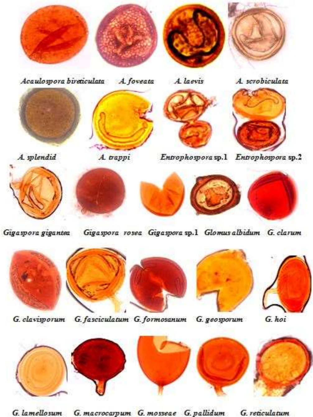
Figure 2. Micrograph showing morphology of different mycorrhizal spores isolated from rhizospheric soil of weeds.

AMF species richness in the rhizospheric soil of respective host plant might be associated with organic matter that may assist root colonization of specific host plant. In soil, the presence of organic matter which serves as a nutrient sink for the plants could also regulate the intensity of