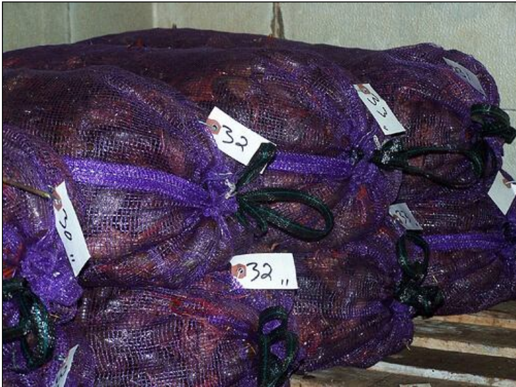
Figure 3. P. clarkii packed live in open-mesh plastic bags.

Resistant species that can withstand packaging and live transport. Crayfish can be packaged in open-mesh plastic bags that hold approximately 18 kg (Figure 3). Healthy crayfish can be stored in humid temperatures of 4-8°C for 6-7 days (FAO 2009). This is a great advantage since a large proportion of wholesale and retail sales are of live crayfish.