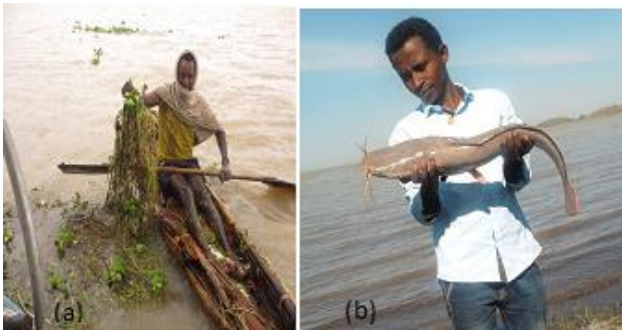
Fig. 3: Fishing net entangled by water hyacinth at the landing site (a) and fishing at area free from water hyacinth (b).

Water hyacinth slows water flow by 40 to 95% in irrigation channels (Jones, 2009). In India in the Brahmaputra River, it has also blocked irrigation channels and obstructed the flow of water to crop fields (Patel, 2012). Moreover, in West Bengal, water hyacinth causes an annual loss of paddy rice by directly suppressing the crop, inhibiting germination and interfering with harvesting. According to the report of Rakotoarisoa (2017) at Lake Alaotra, rice fields were invaded, inhibiting the germination, suppressing the crop.