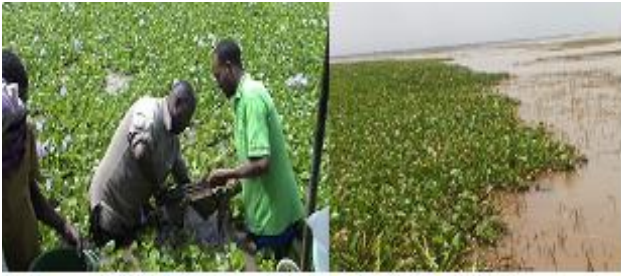
Fig. 2: Impact of Water hyacinth on ecology.