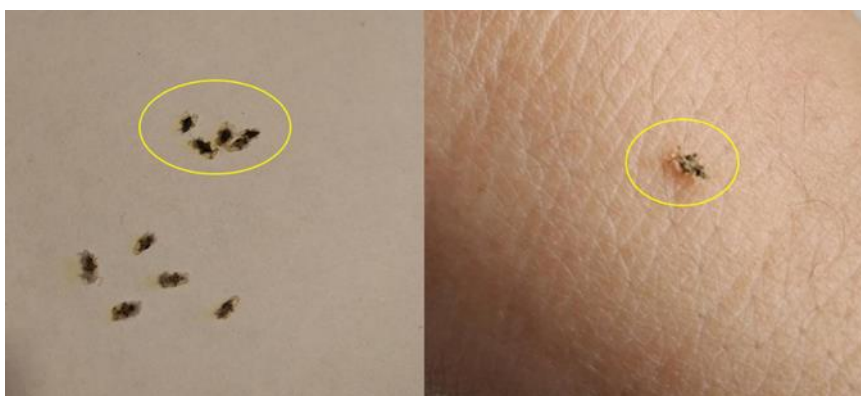
Figure 2 Adult Corythuca c. at the time of the sting (right); adults collected after stinging human skin (left)

In detail, individuals had a chaotic flight and an attraction to human skin. After discussions with 6 people who lived in locations under study, it was concluded that insects had the same manifestations of behavior in the presence of humans. So, adults got on the skin and started pinching at first, annoyingly.