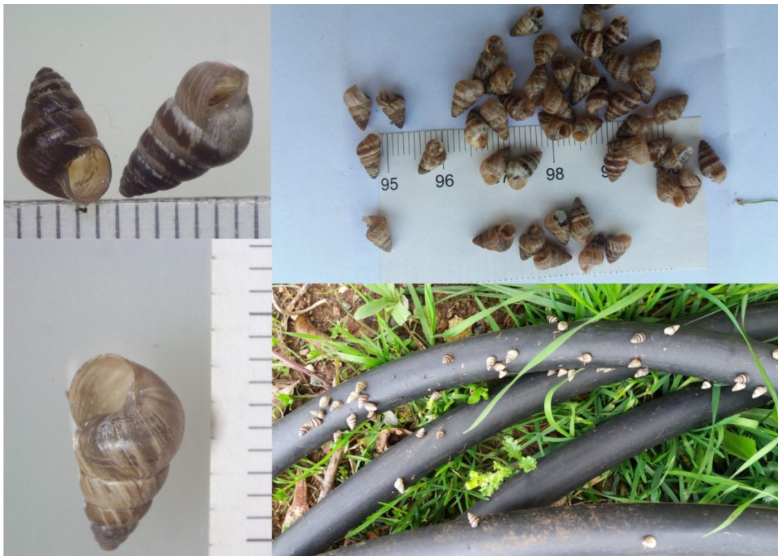
Figure 1. Cochlicella barbara from the center and around Diyarbakır, Turkey.

can be best monitored by a combination of cultural and chemical control. Their natural predators are carnivorous beetles (Godan, 1983; Morrondo et al., 2005). C. acuta is an intermediate host of both Müllerius capillaris (Müller) and Cystocaulus ocreatus Davtian, lungworms of sheep (Godan, 1983). C. barbara can act as an intermediate host for Protostrongylus rufescens (sheep lungworm) (Herbert, 2010). Sheep are naturally infected by bronchopulmonary nematodes on pasture. Adult mollusks are found to be higher than juvenile ones and increased the frequency and intensity of the nematode infection (Morrondo et al., 1992). Larvae development of Nematoda, Protostrongylidae in C. barbari , were studied in detail and possible impact on infection of infected small ruminants was reported northwest Spain (Morrondo et al., 2005). Brachylaima cribbi is a terrestrial trematode of birds and mammals that selects land snails as the first and second intermediate hosts. The presence of B. cribbi sporocysts in 6,432 terrestrial snails collected from eight geographic regions of Australia was investigated in a study. Four snail species, Theba pisana , Cer-nuella virgata , C. acuta , and C. barbara were found to be the first natural intermediate hosts of this nematode (Andrew and David, 2003).