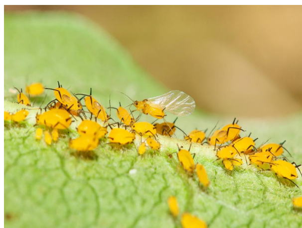
Figure 1. Aphis nerii parthenogenetic females hosting on Asclepias syriaca in south-western Slovakia

For the A. nerii distribution research in Slovakia, citizen science – crowdsourcing on the social networking platforms – designed by Dickinson et al. (2010) and Chamberlain (2018) was also utilised. We adapted this method for the A. nerii Slovak distribution survey. In January 2019, we co-opted the five largest Facebook social media gardening groups moderating in the Slovak language. These