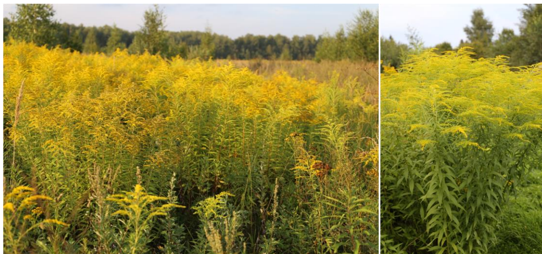
Figure 1 Solidago canadensis L. in the Moscow district, photo by Yu.Vinogradova, September 2016.

Essential oil was obtained from an average sample of aerial parts (leaves, inflorescences and a mixture of inflorescences and leaves) of plants. The oil was extracted from chopped air-dried material by hydrodistillation according to Ginzberg (1932). Qualitative composition of the oil was determined by gas chromatography at the Center for Collective Use of the Federal Research Center “Fundamentals of Biotechnology”, Russian Academy of Sciences, Moscow (RFMEFI62114X0002), using a Shimadzu GS 2010 gas chromatograph with a GCMS-QP 2010 mass detector and SPB-1 nonpolar column (solid-phase-bound methyl silicone) (Supelco, Sigma-Aldrich Corporation) with the length of 30 m and diameter of 0.25 mm. The samples were dissolved in benzene at a ratio of 1 : 150 and chromatographed with the temperature-programming mode under the following conditions: injector temperature, 180 °C; interface, 205 °C; detector, 200 °C. The carrier gas was helium. The flow through the column was 1 cm 3 /min and flow division was 1 : 10. Mass detector settings: logging mode, TIC; mass range, 30 – 400 m/z. The temperature regime for the substances with the retention index of 1300 consisted of the thermostat at 60 °C for 3 min; then, 2 °C.min -1 until 230 °C; and isotherm for 2 min. The temperature regime for the substances with a retention index higher than 1300