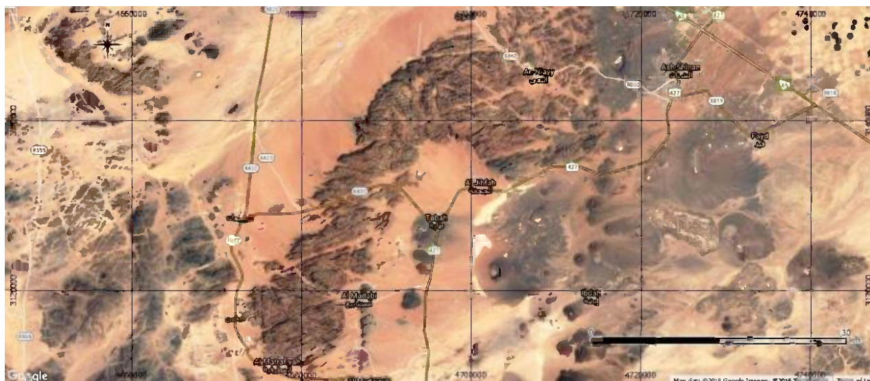
Figure 1 Map showing the study area of Salma Mountains (Map created using QGIS v.2.18.14).