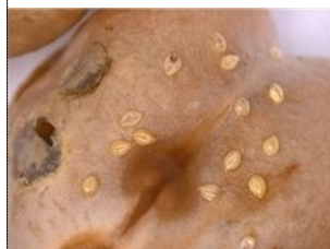
Weevil larvae (NBAIR)