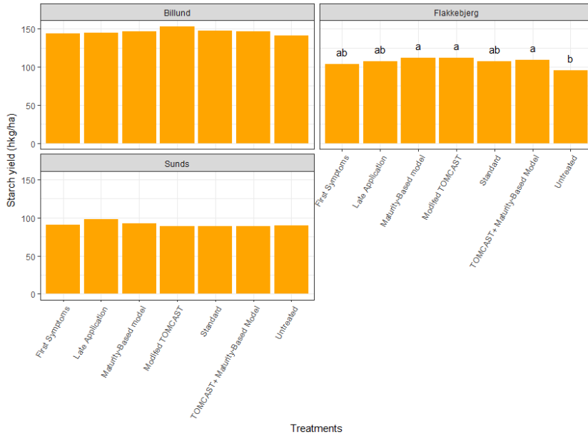
Figure 2. Starch yield (hkg/ha) for the trials at the three experimental locations (Flakkebjerg, Sunds and Billund). Means followed by the same letter within a column are not significantly different ( \alpha=0.05 , Tukey's Honest significant differences). See text for explanation of treatments.