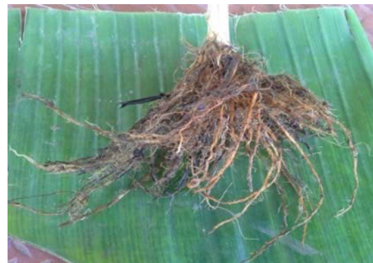
Galls on Echinochloa crusgalli