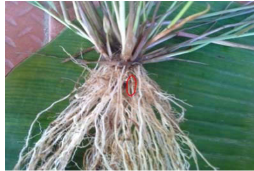
galls on Eragrostis unioloides