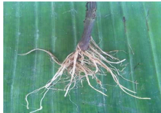
Galls on Hydrilla spp.