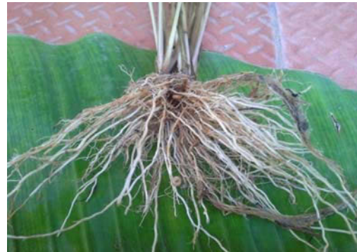
Galls on Panicum repense