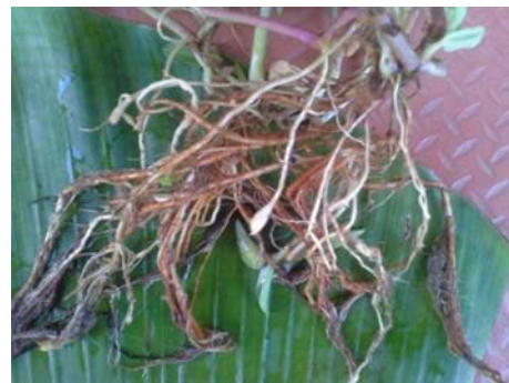
galls on Cynotis culculata