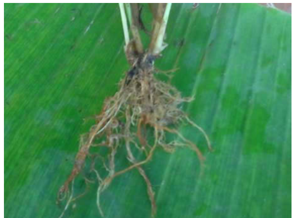
Galls on Elucina indica