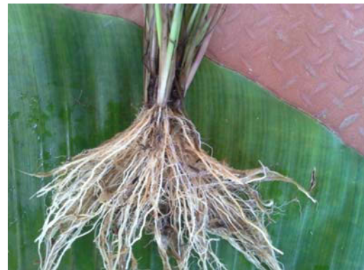
Galls on Digitaria longifolia