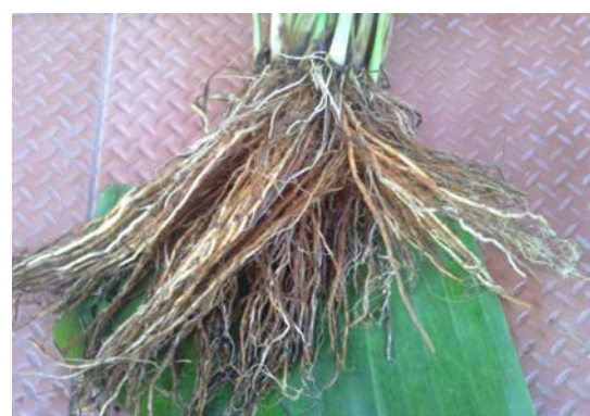
Galls on Echinochloa colonum