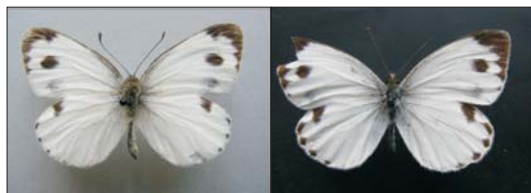
Female Pieris canidia

During current study P. canidia was collected from all districts of study area.