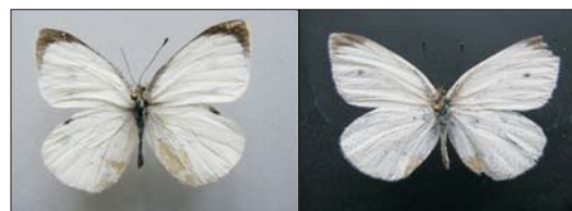
Female Pieris rapae

During current study P. rapae was collected from district Rawalpindi and Islamabad.