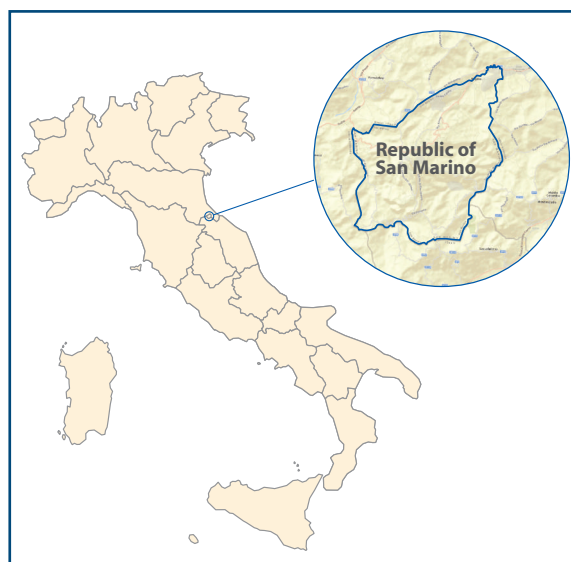
Figure 1. Localization of the Republic of San Marino within the Italian territory.

The Republic of San Marino (43° 46' N, 12° 25' E) is located in the middle of Italy and borders with Rimini and Pesaro-Urbino provinces, respectively in the Emilia-Romagna and Marche regions (Figure 1). The land covers an area of 61,196 km 2 , mostly hilly and clayey. The climate is continental, with hot summers and cold winters and heavy snowfalls. The summer mean temperatures range between 20°C and 30°C, with peaks of 35°C, the winter temperatures range between -5°C and 10°C. The kennel is sited in a hilly area used for the intensive cultivations of wheat, grapevine and orchard, surrounded by rich vegetation.