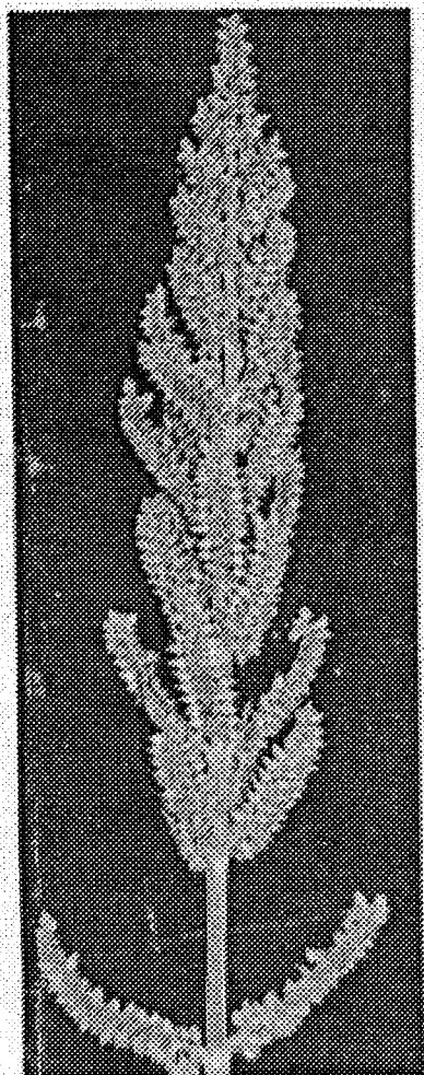
Fig. 1 : Healthy head of barnyard millet

Uttarakhand, the genotypes received for testing under coordinated trials of the All India Coordinated Small Millets Improvement Project are evaluated in Karnataka state as well. The grain smut is a common disease in the barnyard millet growing areas. However, the head smut has been observed for the first time during kharif 2007 in the Barnyard millet Advanced Varietal Trial at ZARS, GKVK, Bangalore.