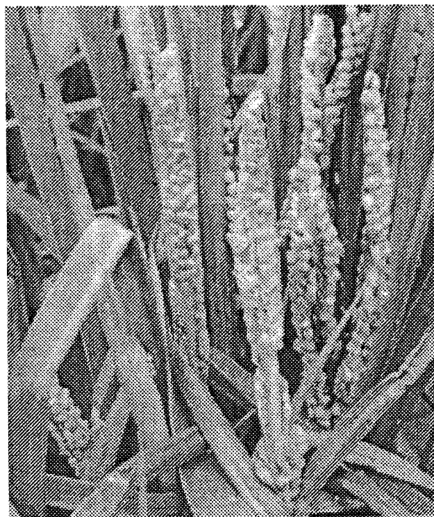
Fig. 1 : Affected ear showing Udbatta symptoms

emerged. No grains formed on the affected panicle. Similar descriptions of the symptoms of damage on paddy were made by Ranganathaiah (1972). Presence of lustrous greyish white films of fungal growth in young leaves of the infected seedlings might be the initial inoculum for the disease spread.