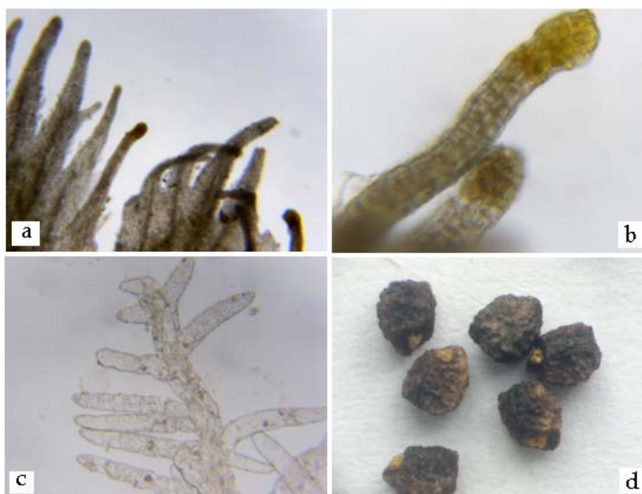
Fig. 2: Euphorbia davidii : a, b – glandular lacinia of cyathium; c – non-glandular bracteoles inside cyathium; d – seeds