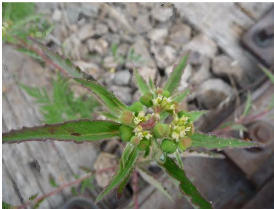
Fig. 1: Euphorbia davidii : inflorescence

As a result of the revision of the herbarium material, previously determined as E. dentata Michx., we found that all specimens collected in Romania belong to the species E. davidii Subils; consequently E. dentata Michx. has been previously published from Romania in error.