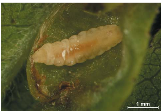
Figure 3. White, flattened larva before pupation

Slika 2. Šiške odmirajo v času izleganja adultov (opazni sta dve bubini ovojnici)