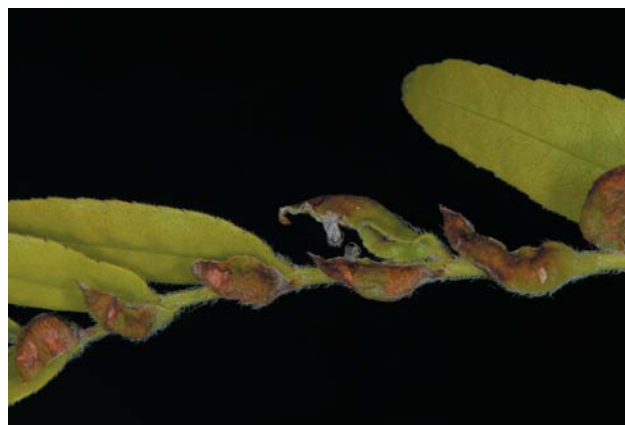
Figure 2. Galls are dying in the time of adults emergence (two pupae exuviae are visible)

Slika 1. Z Dasineura gleditchiae napaden list Gleditsia triacanthos je delno spremenjen v šiško