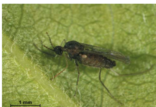
Figure 6. Adult male