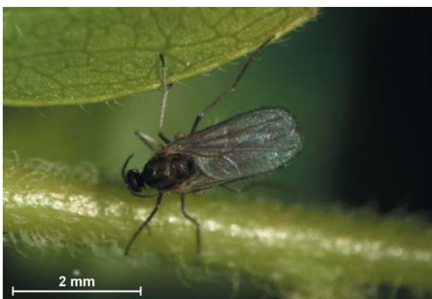
Figure 5. Adult female