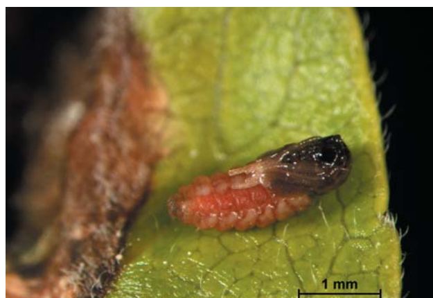
Figure 4. Pupa is red before eclosion

Slika 3. Bela, sploščena ličinka pred zabubljenjem