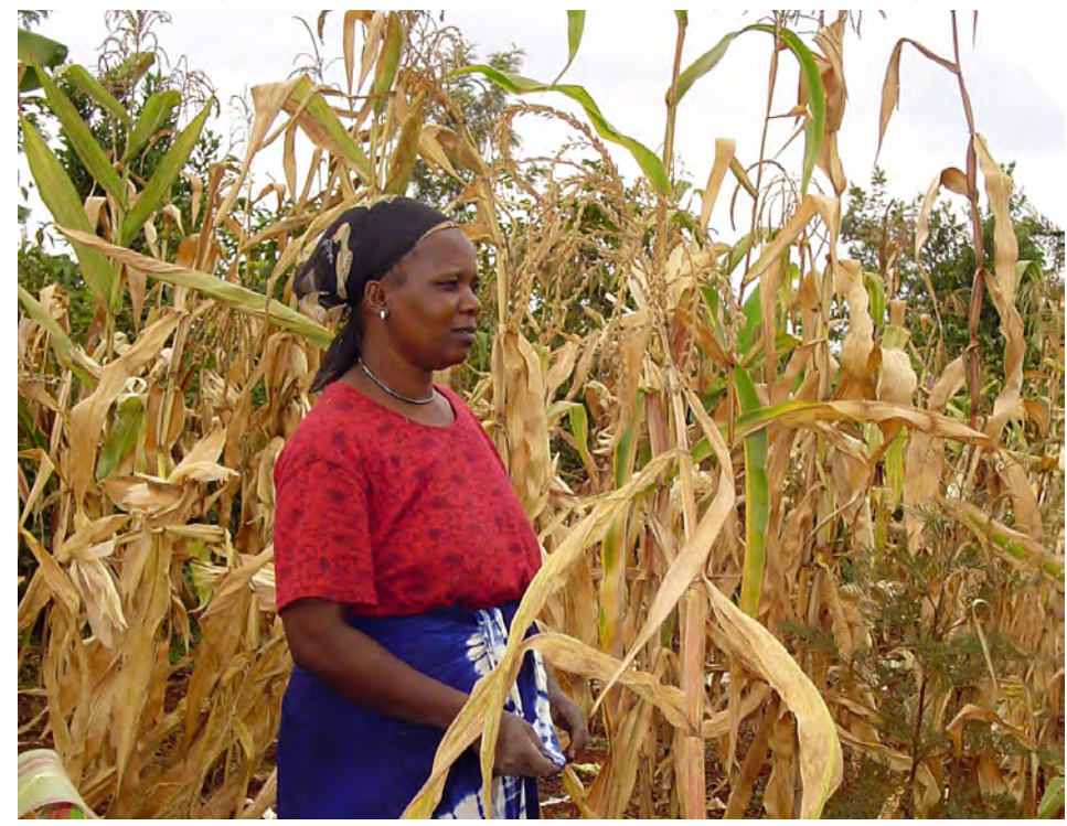
Mozambique, Rwanda, Uganda, Tanzania, Zambia and Zimbabwe.

In Africa, COMESA is a key partner, together with Burundi, Ethiopia, Kenya, Malawi,