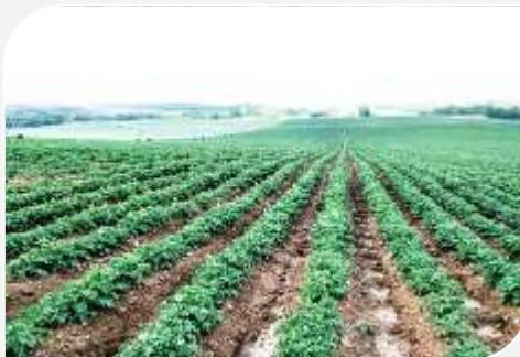
“Crop Rotation” Snow Valley farms

Partners: Yantai Academy of Agricultural Sciences