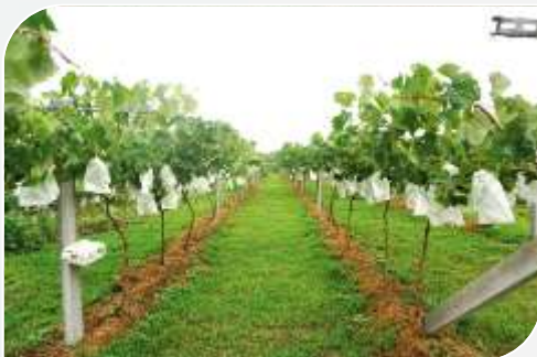
“Green Cover” project in Grape & Apple orchards in Yantai

In 2017, our soil conservation programs benefits 36,666 ha. in China