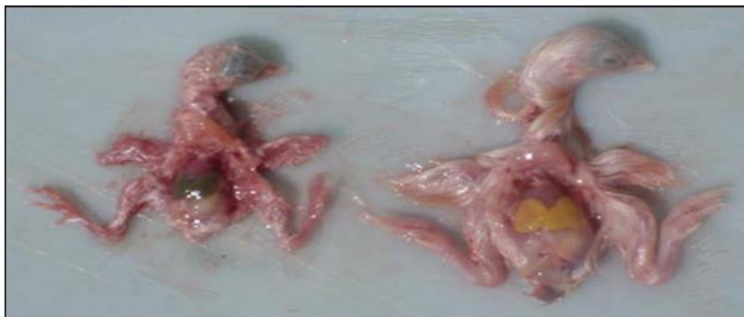
Figure 1 Anatomopathological observations, in the left side inoculated embryos presented reduced size when compared to control embryo in the right side.

Primer Forward: 804: 5'GTA ACA ATC ACA CTG TTC TCA G 3' Reverse: 1055: 5'GAT GGA TGT GAT TGG CTG GG 3'