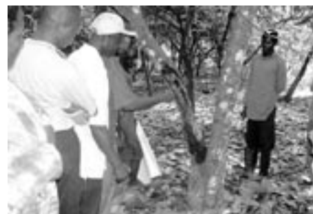
The field trip during the workshop was an opportunity to meet FFS-trained farmers and practise using modelling and other tools to enhance discussions on FPR