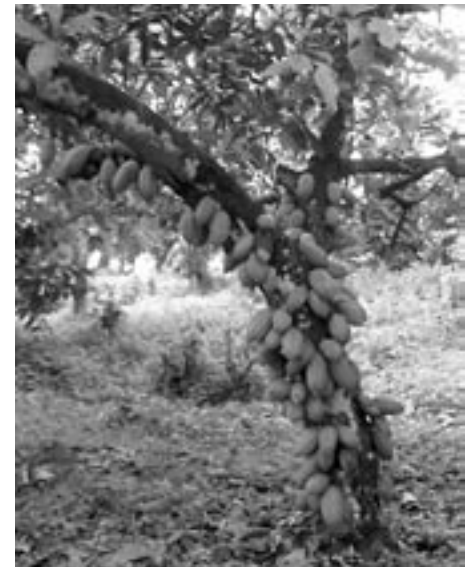
Heavy crop resulting from synchronised mass manual pollination of a tree that had under-cropped over a long period. When all the young pods are the same physiological age, the natural mechanism for limiting the crop fails, and trees will over-bear. However, if this is repeated too many times, the pods ripen prematurely, the canopy weakens and the tree starts to die back. If these warnings are ignored and the pollinations continue, trees die

explained Malaysian plantation observations that yields were higher if seeds were produced by manual pollination.