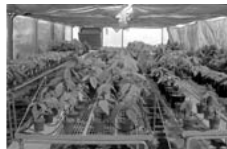
The propagation compartment of the University of Reading Intermediate Cocoa Quarantine Facility

In terms of the broader programme of cocoa-related activities, the quarantine facility initially came to Reading because research on cocoa physiology was underway here during that period. Over time, the situation has turned full circle so that the quarantine facility itself now provides material for a wide range of research on physiology, genetics, pathology and somatic embryogenesis.