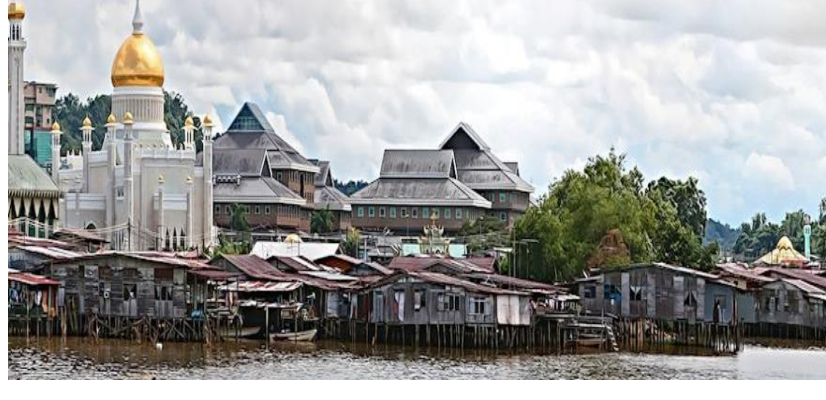
Working in Partnership with CABI – Brunei Darussalam