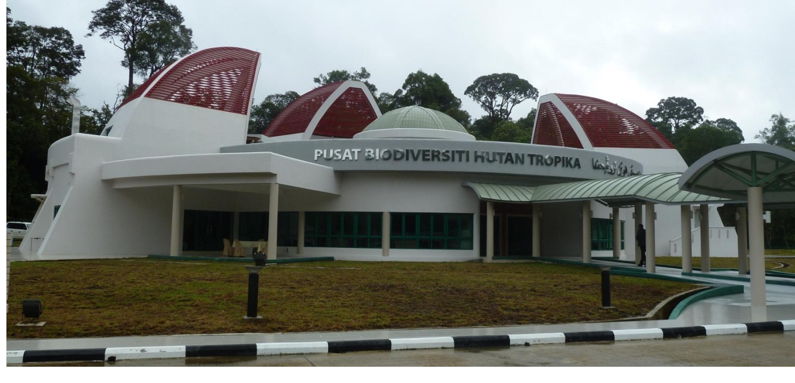
The Brunei Darussalam Biological Resource Centre